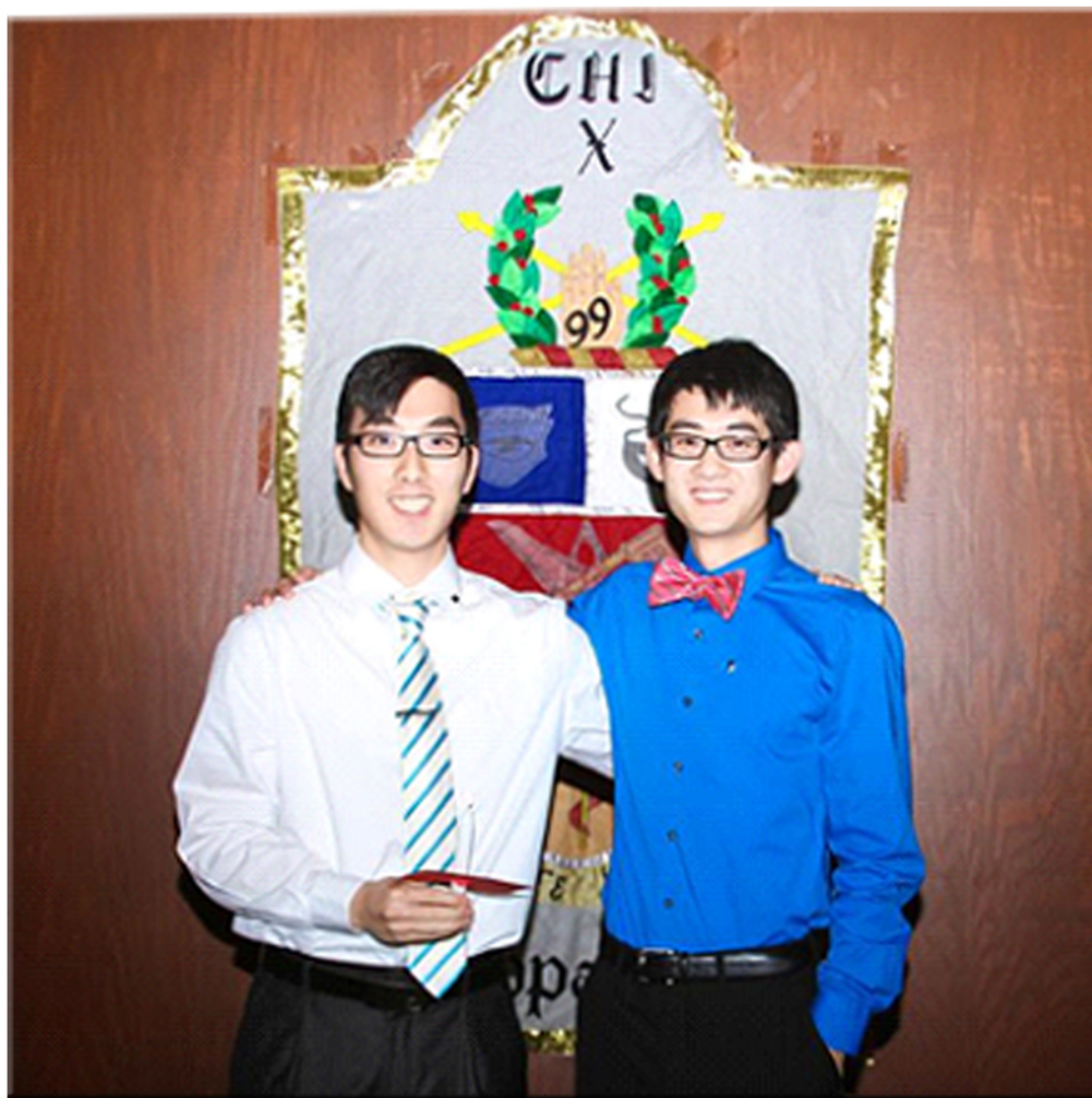
Xi Class Pinning Ceremony 2014

"IN THEM WERE REMINDERS OF HOW TO TREAT ONE ANOTHER, OF THE TRUE MEANING OF BELONGING TO THE FRATERNITY, AND AN UNDERSTANDING THAT, NO MATTER WHERE WE END UP, STRONG KAPPA PSI HANDS ARE THERE TO HELP AND GUIDE US ON OUR WAY."