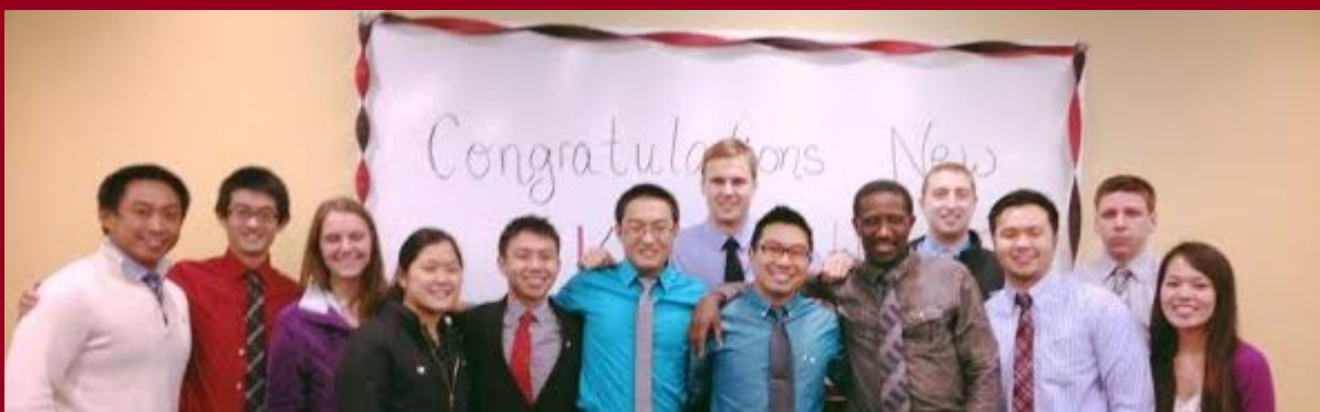
Mid-America Province Brothers bonding.

ways I couldn't begin to describe. Watching the smiles on the faces of the new Initiates brought a smile to my own, and I remembered the warm feeling of when I first was surrounded by the clapping and cheering. I had an opportunity to catch a glimpse into the Epsilon Omega pledging process that night as well, and it was interesting to hear about many of the events they participated in that were different from my own pledging process. This is normal across all